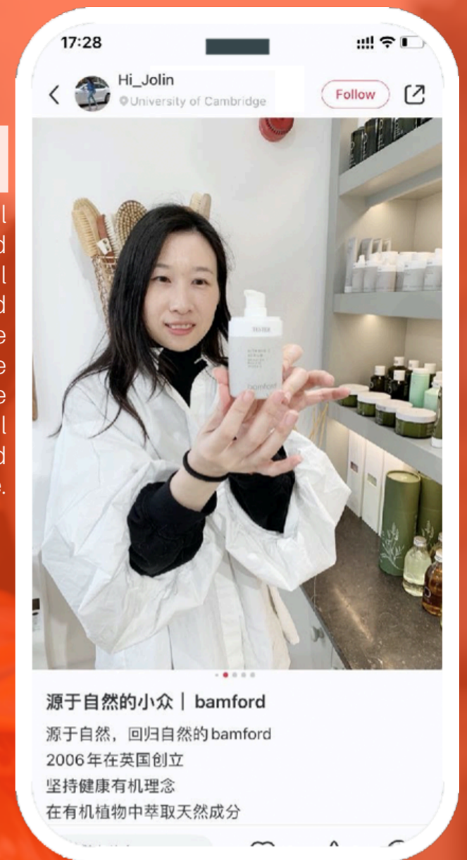
EXAMPLE SHOW ABOVE IS FOR AN IN-STORE POST FOR A LEADING BRITISH WELLNESS BRAND GENERATED THROUGH DUELSTONE

Red is the social media platform used by Chinese Global Shoppers to find Posts from Chinese Creators around the world who have already used global products and shared their experience.